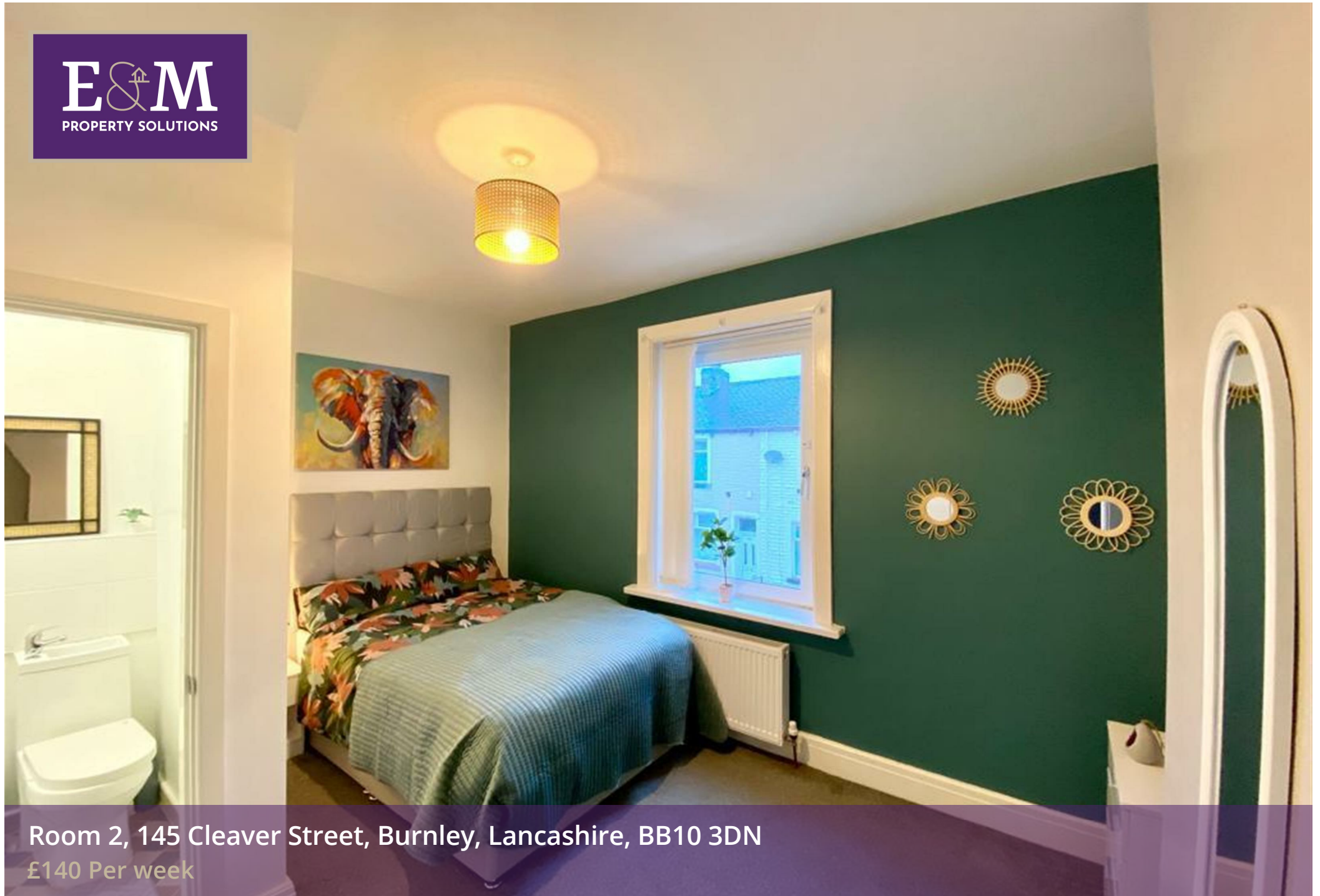
Room 2, 145 Cleaver Street, Burnley, Lancashire, BB10 3DN £140 Per week